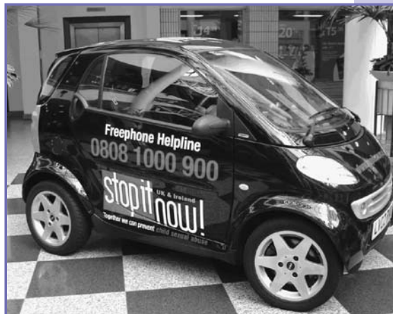
Innovative advertising in Surrey

practioners, grant making bodies, and the general public. In Northern Ireland, a new site opened this fall, and at the Surrey site, there has been some innovative advertising with its “Smart Car,” painted with the Now! logo and images. The car is used on local roads and appears at public events both locally and nationally.